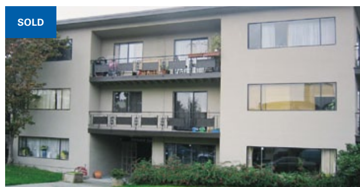
SOLD Dickson Place 242 East 14th Avenue, Vancouver Apartment Building, 20 Suites $4,600,000