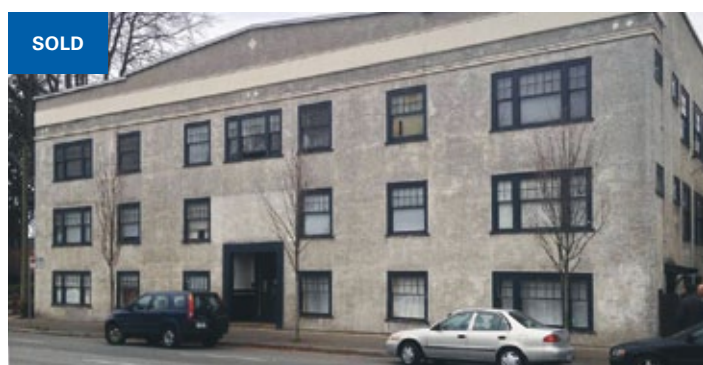
SOLD Langara Apartments 2930 Cambie Street, Vancouver Apartment Building, 14 Suites $3,250,000