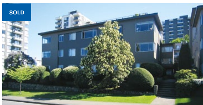
SOLD Marine View Terrace 2350 West 1st Avenue, Vancouver Apartment Building, 16 Suites $5,995,000