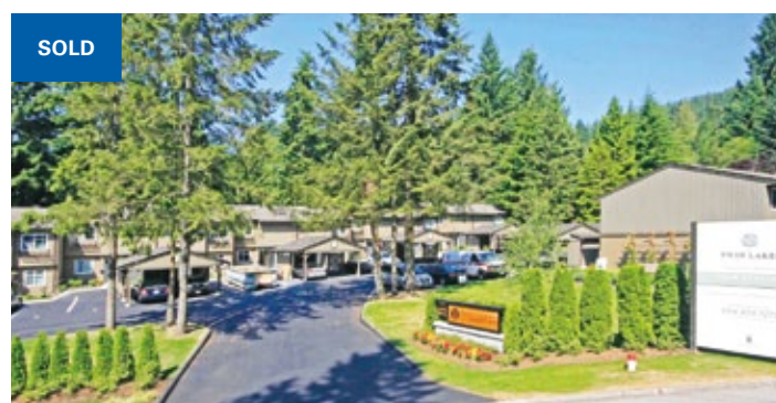
SOLD Twin Lakes 3701 Princess Avenue, North Vancouver Townhouse Complex, 57 Suites $27,950,000