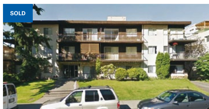
SOLD The Ambassador 516 Ash Street, New Westminster Apartment Building, 28 Suites $3,495,000